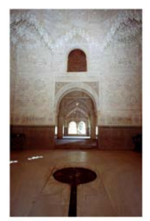
Fig. 2. William Keighley, 'Interior: view of Hall of the Two Sisters from south,' 1969, The Image Library, The Metropolitan Museum of Art.

means to collect the power of the divine, then the rays of starlight act as the medium in which that power is transmitted. In the Ouran, the stars are said to bow, but this "act of prostration here is not literal but indicates the stars' casting down influences to earth and being the efficient causes of the generation of all terrestrial things."4 This act of prostration is then more akin to the light that shines down from the heavens, reaching out like fingers severing the clouds.