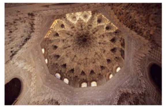
Fig. 3. Elizabeth Barlow Rogers, 'Hall of the Two Sisters, Court of the Lions, interior, 1996, Foundation for Landscape Studies.

Through the consistent use of abstract ornamentation, the Nasrid sultanate exercises this concept of supersensory perception in order to imbue these ordinary stars with meaning imperceptible by those not allied with the sultanate. The celestial bodies thus become ambiguous representations of the godlike attributes of the Nasrids as well as references to what they believe to be their place within the cosmos, above their countrymen and among the concentric circles within the realms of heaven. The architecture, in conjunction with the ornament. of the Alhambra creates this notion of a heaven on earth, continuing to blur the lines between the physical and metaphysical. It is the philosophy outlined by the Rawdat al-Ta'rif bil-Hubb al-Sharif that provides the Nasrids with this distinct ability to empower themselves through abstraction in comparison to the more corporeal nature of visual language of the Madinat al-Zahra. This same philosophy allows the ornament to also become a tool of legitimation, to prove the virtuosity and divinely-ordained power of the ruling dynasty.